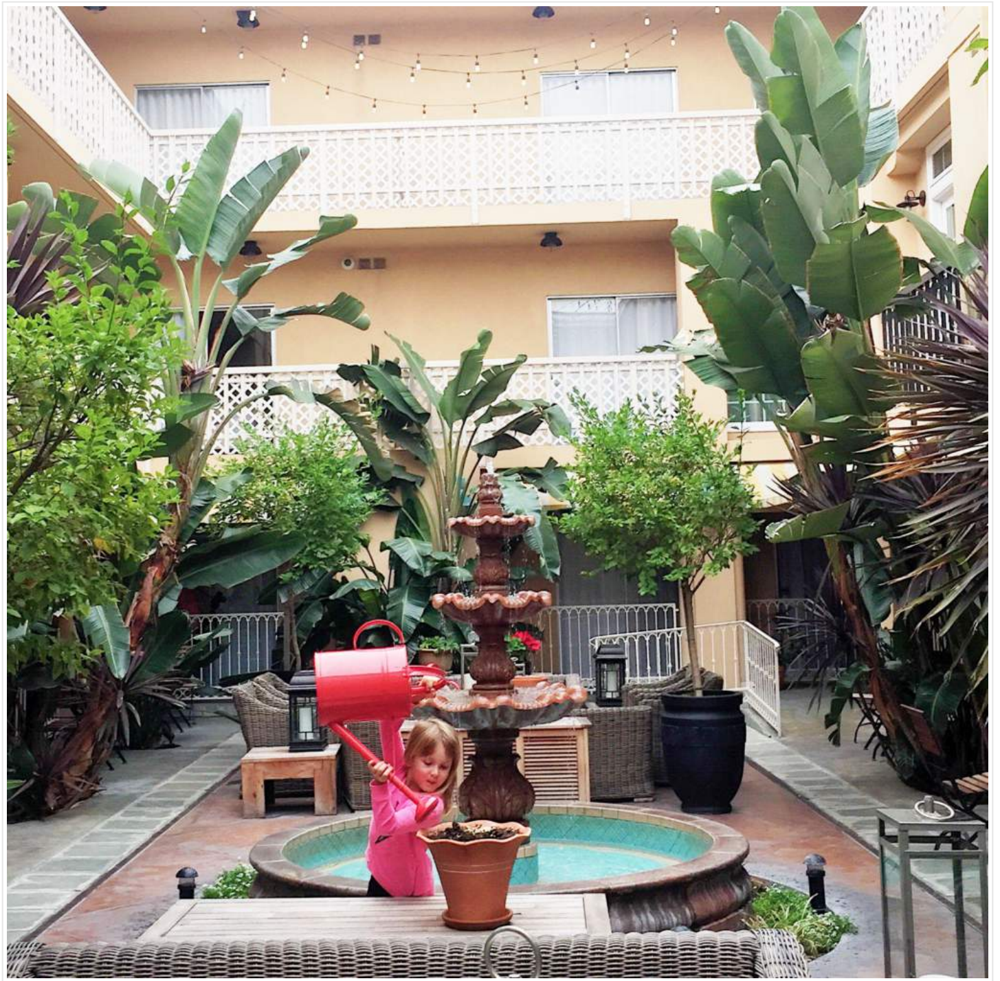
She cracks me up! "Mommy, look at this big watering can! Can I try it?" "Sure"! She loved it!