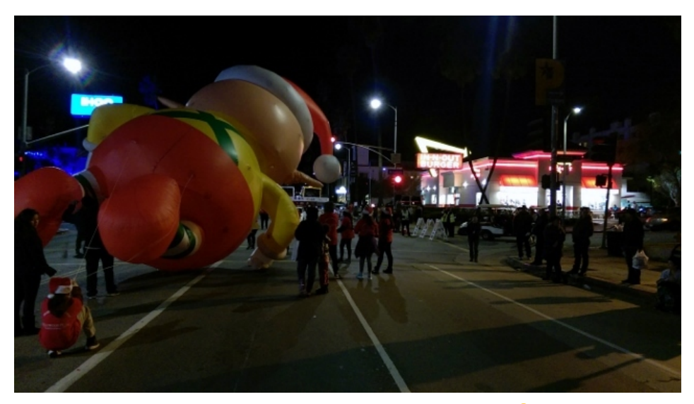
Laying the balloon out flat to dodge wires. There's In-N-Out! 😃

Most of the balloon wrangling is easy enough; we just have to keep the right pace and manage the balloon as it sways in the unseasonably strong wind. The toughest parts come with dodging traffic signals hanging over the street. We navigate around them with a little effort and lots of teamwork. The particularly annoying obstacles are the few wires that cross the parade route. Those require the fairly tall elves to be laid out almost horizontally to get under the wire. It's like playing a coordinated game of limbo to get the elf down and then forward without making contact with the wires.