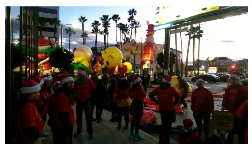
The Hollywood Hotel team standing by while the elves get a full dose of helium.