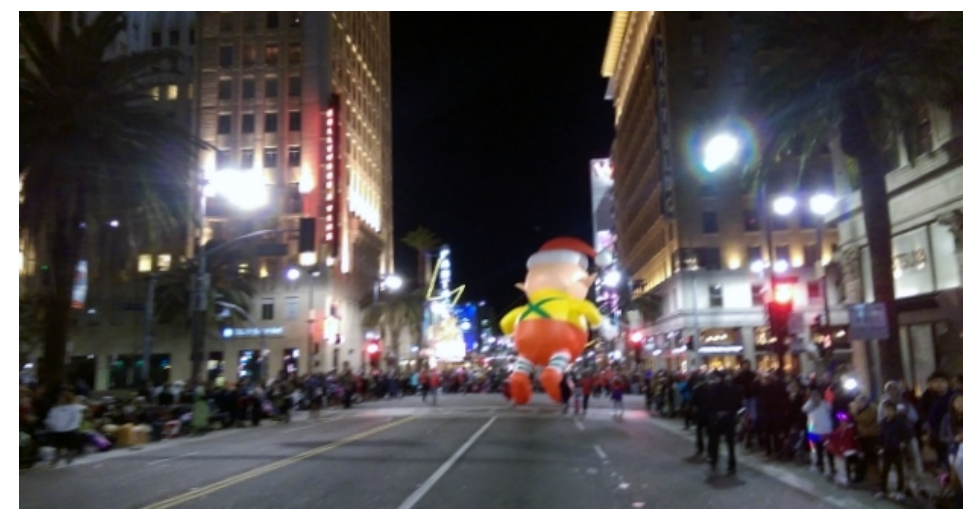
Turning from Hollywood Blvd onto Cahuenga with the Pantages Theater and the W Hotel in the distance.