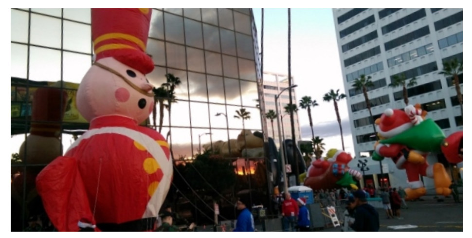
Filling up balloons.