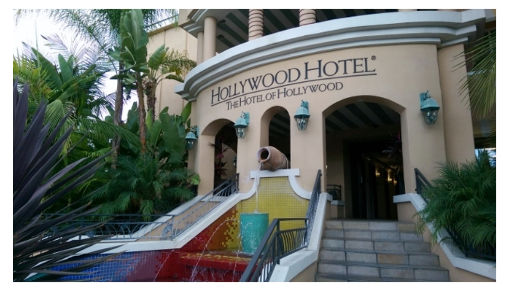
Arriving at the Hotel.