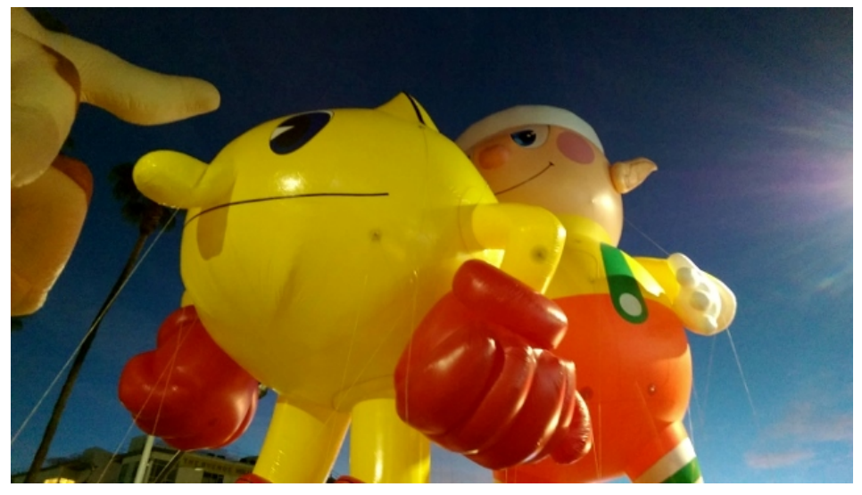
Pac Man and the Red Elf.