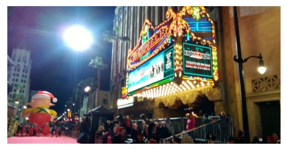
The El Capitan Theater.