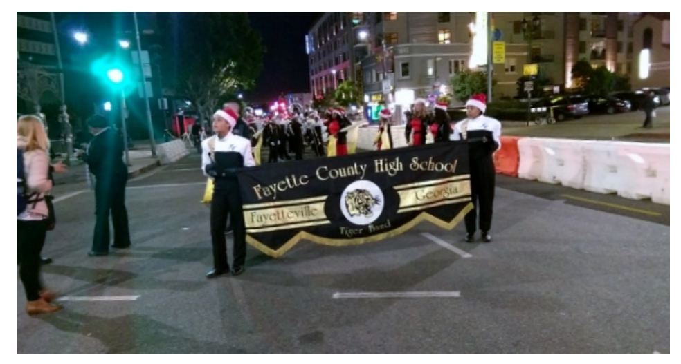
Marching bands came from all over the US, including this one from Fayetteville, GA.