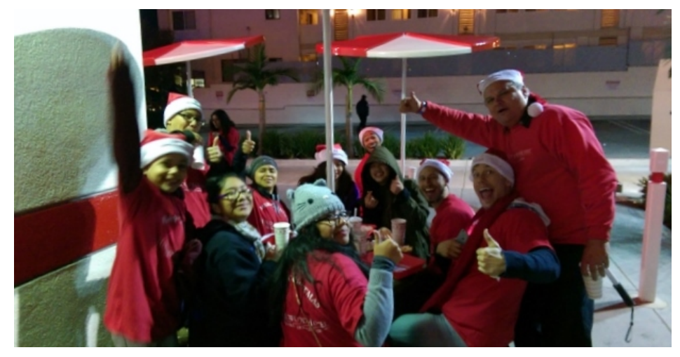
Celebrating a successful parade with the team at In-N-Out.