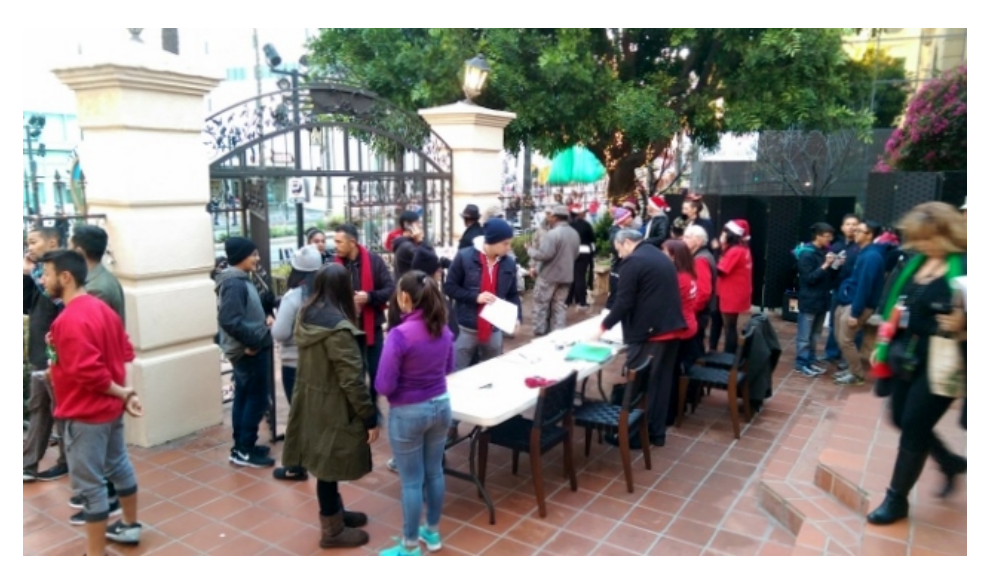
Registration at Parade HQ.

Arriving at the parade HQ, I find hundreds of volunteers getting their assignments as the organizers make short work of keeping up with everyone. They make it look easy! But I guess that's what 85 years of operational experience gets you. I get my marching orders and head out to join my team at our staging location.