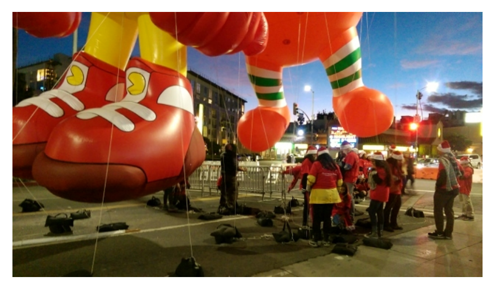
Learning the ropes.

After getting the balloons filled and in place, there is quite a bit of time until we get underway. The parade is already in progress, however, with marching bands, cowboys on horses, and floats all streaming onto the parade route from alleys and side streets around Hollywood Blvd. The balloon teams make use of the time, literally learning the ropes and getting a feel for balloons as they bounce and sway with the gusts of wind cutting in between the tall buildings. We also share a moment with band members as they march by and watch Korean dancers getting in some last minute practice before performing on the red carpet.