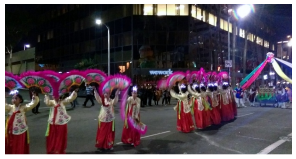
Korean dancers rehearsing.