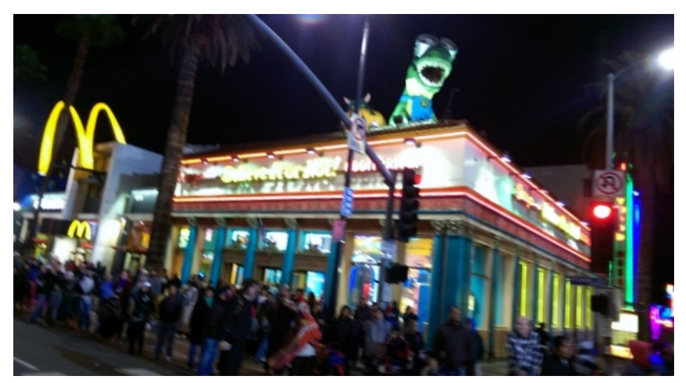
Ripley's Believe it or Not.