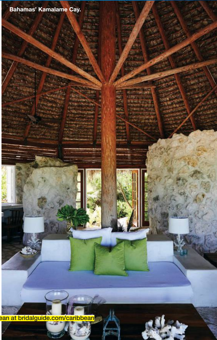
Bahamas' Kamalame Cay.

The Dominican Republic boasts many all-inclusive, mega resorts, which are great if you have a big wedding, but some- ➔