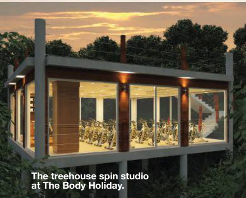
The treehouse spin studio at The Body Holiday.