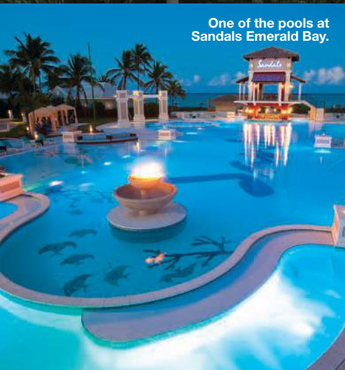
One of the pools at Sandals Emerald Bay.