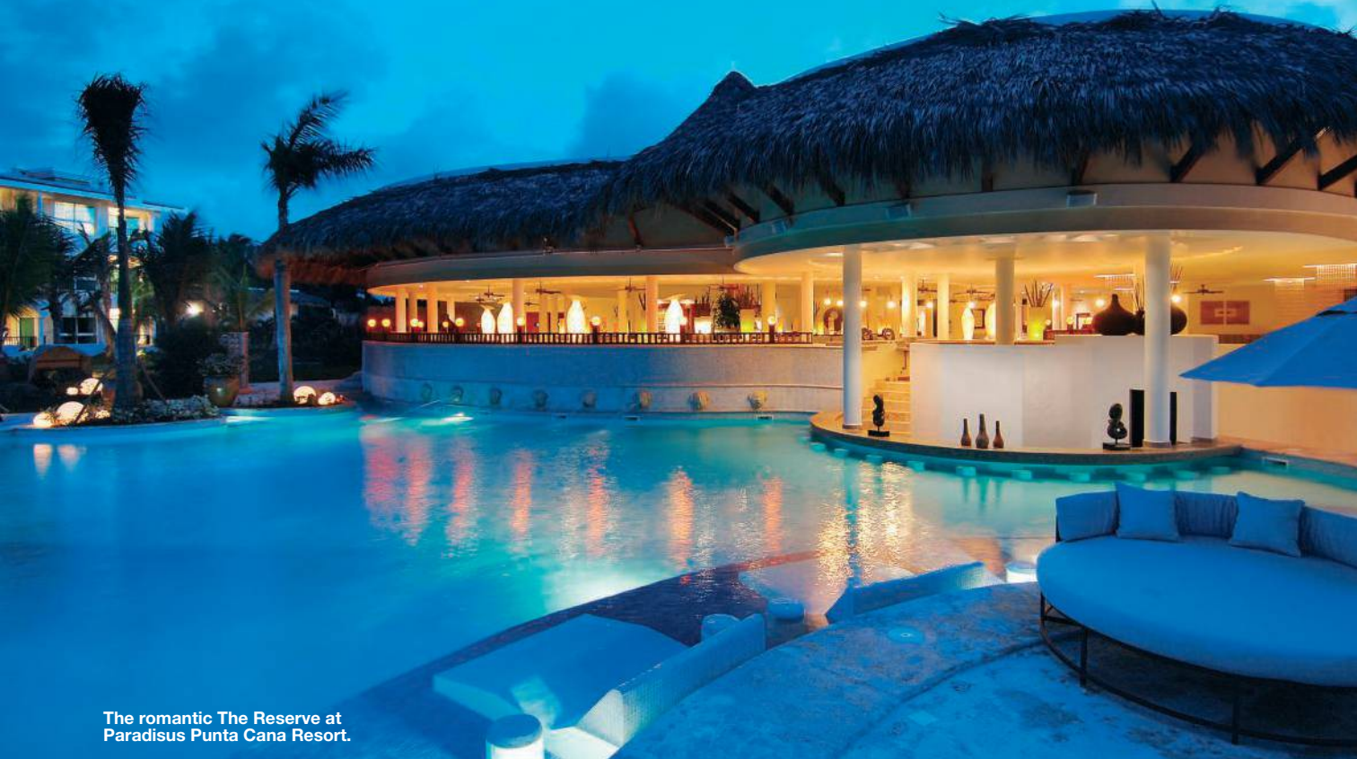
The romantic The Reserve at Paradisus Punta Cana Resort.

Choosing an all-inclusive hotel can be confusing. Truly. In theory, the various resort groups offer a similar vacation experience, but they differ widely in size, style and vibe—even with what’s included in the price. So we crisscrossed the Caribbean and discovered the best all-inclusive options for every kind of couple. There’s bound to be a perfect fit.