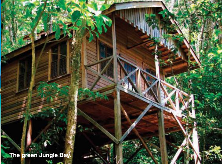
The green Jungle Bay.