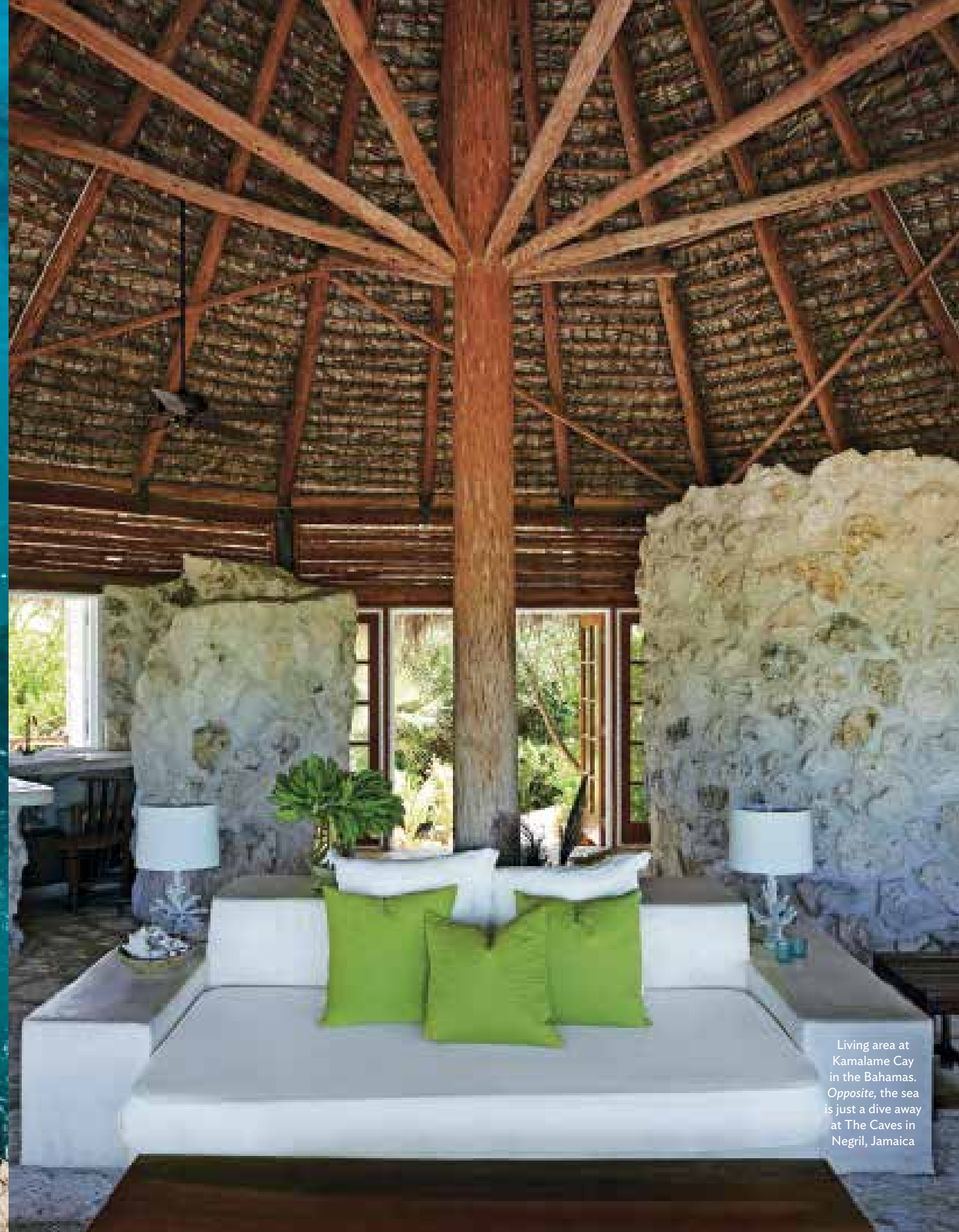
Living area at Kamalame Cay in the Bahamas. Opposite, the sea is just a dive away at The Caves in Negril, Jamaica