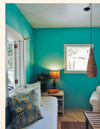
CLOCKWISE FROM ABOVE: Scenes from paradise, including an open-air bar with stone touches; a vignette from the villa bedroom; the cozy living room and dining area; a sitting area at the tiki bar; front view of the Magnolia House.