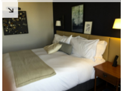
Bedroom at the Press Hotel in Portland.

Walking into Portland's Press Hotel for the first time was an awesome experience. I'd read a lot about the conversion of the Guy Gannett Building, which houses the Portland Press Herald, into a beautiful, luxurious downtown hotel. But seeing it was a special treat. They have managed to create a gorgeous, modern hotel, with tons of amenities, while keeping its history alive — starting with a wall of old typewriters just to the right of check-in desk.