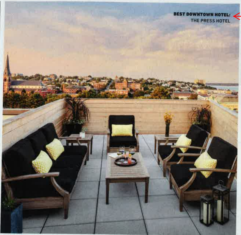
BEST DOWNTOWN HOTEL: THE PRESS HOTEL

The full-service Press Hotel's décor takes its cue from its home in the former headquarters of the state's largest newspaper. Fronting on Congress at the head of Exchange and Market streets, the location is ideal for exploring the city. The hotel's Union restaurant earns raves. Rates: from $175. 119 Exchange St. 207-808-8800; thepresshotel.com