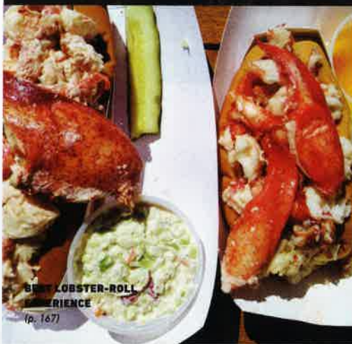
BEST LOBSTER-ROLL EXPERIENCE (p. 167)