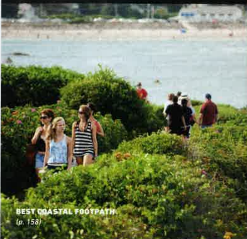
BEST COASTAL FOOTPATH (p. 158)