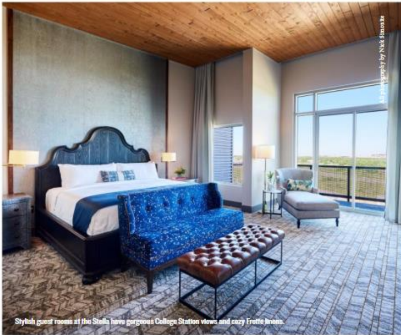
Stylish guest rooms at the Stella have gorgeous College Station views and cozy Frette linens.