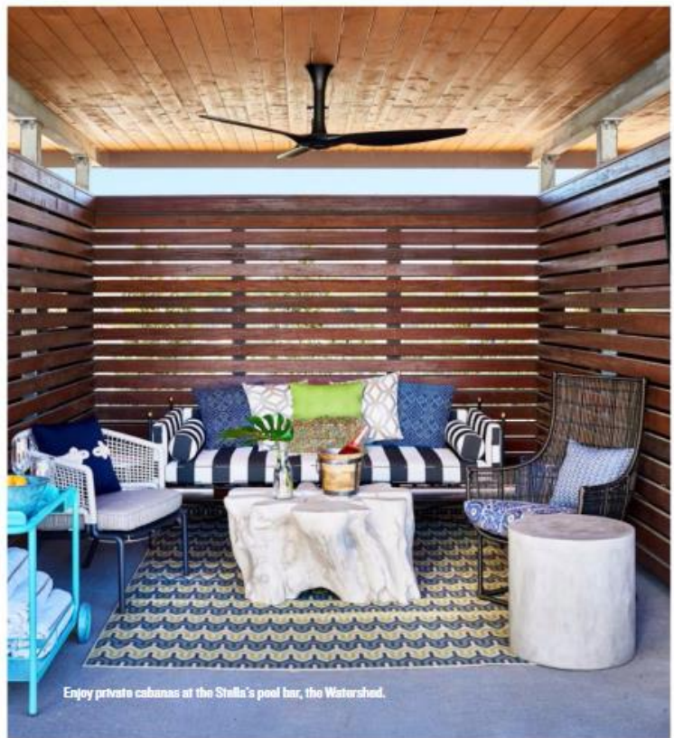
Enjoy private cabanas at the Stella's pool bar, the Watershed.