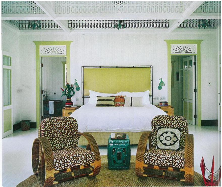
PLAYA GRANDE BEACH CLUB Dominican Republic

This beachfront retreat on Shoal Bay East—known for its sugar-white sands and low-key beach bars—has 54 guest rooms, 9 suites, and 27 larger residences, all with private outdoor spaces and sea views. The resort's showstopper is a 15,000-square-foot spa, built within a wooden house transported from Thailand. The Rhum Room stocks more than 100 rums. From $530.