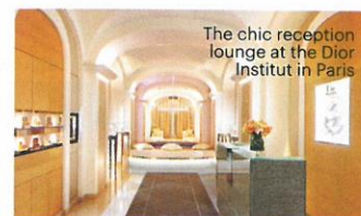
The chic reception lounge at the Dior Institut in Paris

SOUVENIR SUGGESTION Dior Prestige Le Concentré Yeux, $215.