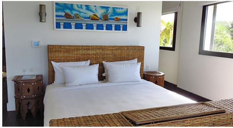
Corner King Room at Zemi Beach House

With one bed, and with corner windows that let in extra light, the corner rooms are far brighter and more spacious. They have the same view ahead, though the view to the left (in a western building unit) overlooks private non-Zemi Beach Anguilla villas.