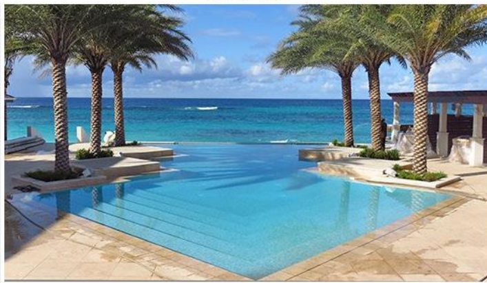
The Main Pool

The 20 Knots restaurant will feature breakfast, lunch and dinner, with a focus on blending Caribbean and Mexican/Latin American flavors and styles. Their second, fine dining restaurant with an Asian flare is underway now. There will also be a rum room to be used for rum tastings, conferences and other gatherings.