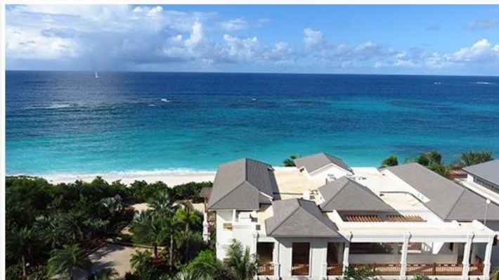
Views Looking Straight Ahead

The jewel of the Penthouse Suites is the plunge pool, located on a private roof-top storey.