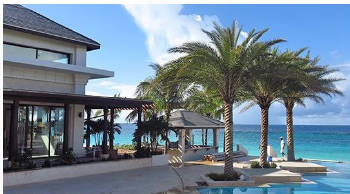
20 Knots, Adjacent to The Pool

The 20 Knots restaurant will feature breakfast, lunch and dinner, with a focus on blending Caribbean and Mexican/Latin American flavors and styles. Their second, fine dining restaurant with an Asian flare is underway now. There will also be a rum room to be used for rum tastings, conferences and other gatherings.