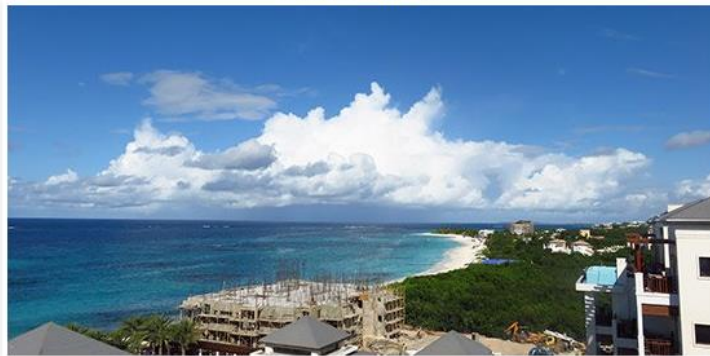
Views Looking East