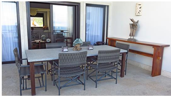
Outdoor Dining Space