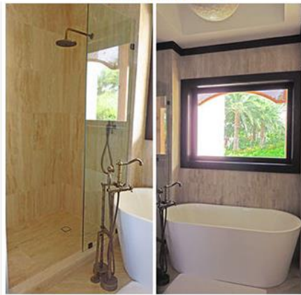
Deluxe Room Bathroom

The bathroom's wood vessel sinks are impressive!