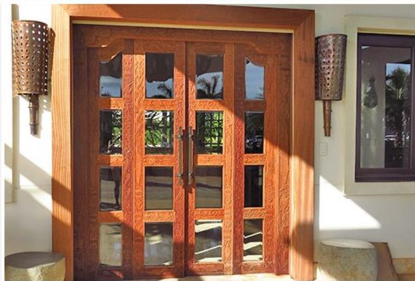
Hand-Carved, Balinese Door

Though made in Bali, this door has a dual effect in that its design also evokes an integral part of Zemi Beach House... its tribute to Anguilla's Arawak heritage.