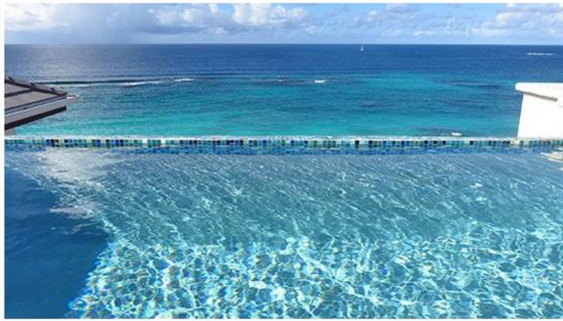
The Penthouse Pool View Ahead

In-season, these suites start at around $1,800/night and go up to $7,000/night, if you select the "beachfront" option.