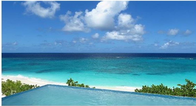
The Intimate View From a Second Storey Beachfront Suite

Right on the sands of Shoal Bay East, if it is beachfront you are seeking, the beachfront suites are worth the high price. Their beachfront units are not set back from the sand line, more of a rarity in hotel rooms and villas in Anguilla. The ground level suites let you step directly from your terrace onto sand.