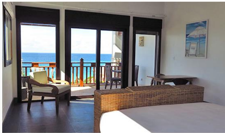
Corner King Room View

With one bed, and with corner windows that let in extra light, the corner rooms are far brighter and more spacious. They have the same view ahead, though the view to the left (in a western building unit) overlooks private non-Zemi Beach Anguilla villas.