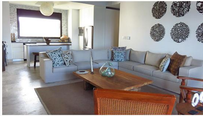
Penthouse Living Space & Kitchen

... as well as ample outdoor dining space.