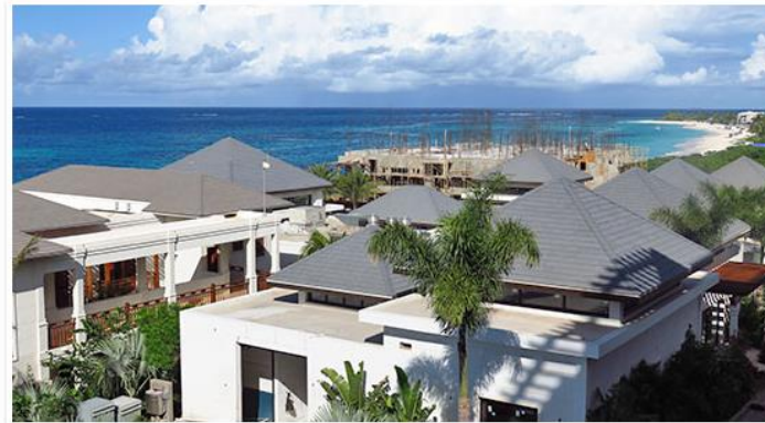
Overlooking Zemi Beach House From the Far-Western Building