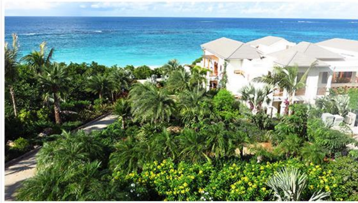
Deluxe Room View

It also features a mini bar, Bluetooth sound system and a slick air conditioning system that is controlled by your body's movements around the room. A spacious bathroom is set behind the main room, complete with a walk-in shower and sink tub.