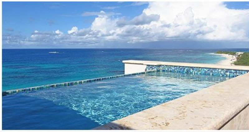
The Penthouse Pool to the East

The blues melt into each other as you sit inside the plunge pool. Gazing east you can even see all the way to Little Scrub.